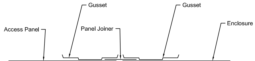
INSTALLED DETAIL (View from above)

NOTE: All fasteners to be supplied by others.